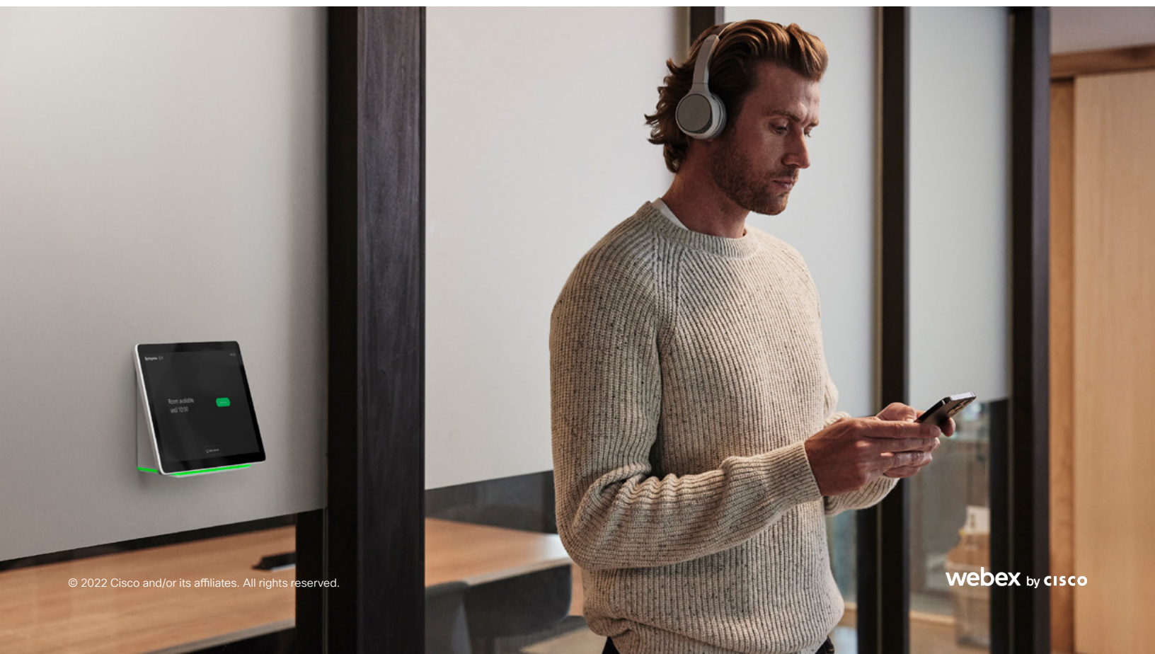
Figure 2: Webex Room Navigator mounted on glass wall, displaying room availability and allowing for instant room booking

Webex Room Navigator is a competitive, feature-rich and highly flexible solution that can be used either that can be used either as a room and conference control panel or a dedicated scheduling display, has a robust device management platform, and offers rich sensor data that supports creating a safer and optimized workspace environment.