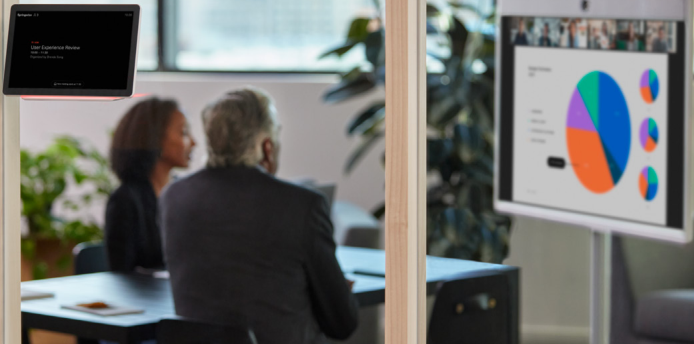
Figure 1: Webex Room Navigator unit mounted on glass wall showing meeting room availability

Transform your workplace with simple and intelligent experiences while eliminating the friction from the employee journey. The wall-mount Webex Room Navigator touch panel is designed to bring ease and convenience into modern workspaces by providing instant access to conference controls, smart room booking, room controls and your go-to workplace applications.