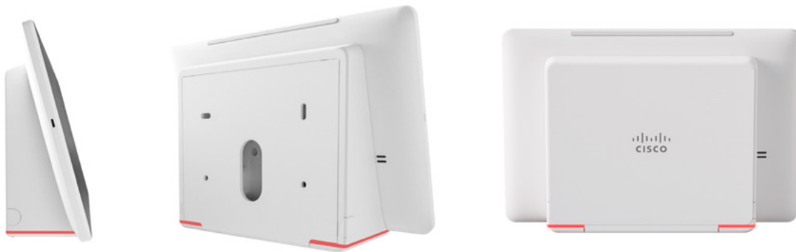
Figure 5: Rear and side views of the Room Navigator

The list above reflects the regulations applicable at the time of publishing this document. For an updated list of regulations applicable, see the Product Approval Status Database for approval documents per country