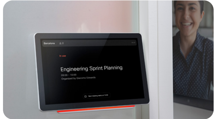
Figure 3: Webex Room Navigator deployed as room scheduling display

With the Webex approach to room controls and space reservation, you can significantly simplify your deployment, lower total cost of ownership and ease management efforts by leveraging a single vendor to provide platform agnostic video collaboration devices, the underlying meeting service, the room control hardware, and the associated room booking software solution.